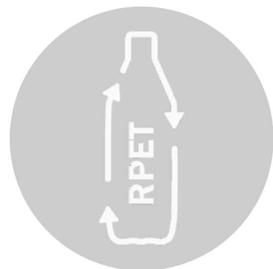
Plastic bottles are cleaned

For every 20 plastic bottles recycled, the material is recycled and reused to create 100 RPET Lanyards.