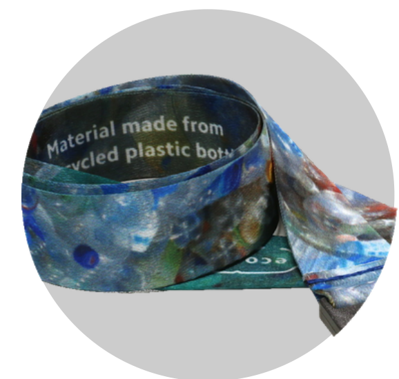
Plastic is then spun into thread