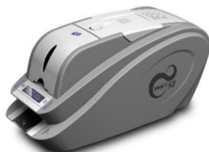
ID Card Printers