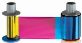
ID Printer Ribbons