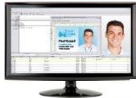
ID Card Software