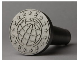
.9 in. (22.86 mm) Global Design