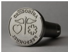
.9 in. (22.86 mm) Medical Design