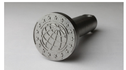
Example of a generic tactile impression die.

The tactile impressor feature, designed exclusively for use in the Datacard® SD460™ card printer and CD800™ card printer with inline lamination module, offers an affordable and entry-level security feature ideal for any card program. This patent-pending feature utilizes a mechanical die within the laminator that physically impresses a generic or custom design directly onto the card substrate and overlay or patch laminate in the same pass. The final output is a card with added counterfeiting and tampering resistance that will impress any cardholder.