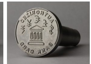
.9 in. (22.86 mm) Bank Design