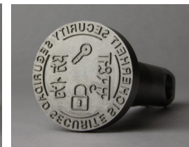
.9 in. (22.86 mm) Security Design