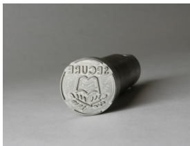
.5 in. (12.7 mm) Education Design