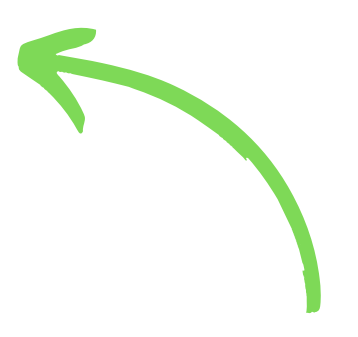
Click the image see to how you can become more environmentally friendly

Eco-friendly products contain materials that have been recycled, are easy to recycle, or are gathered from a natural source like bamboo or cotton